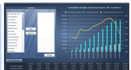
SAP BI Report

About Experion: A 5+ year old company founded and managed by a team of experienced professionals with more than 200+ years of combined experience in technology and international business. Experion has a track record of delivering enterprise, mobile, web and engineering solutions to over 50 customers worldwide. Our customers range from Fortune 500 and Global 2000 corporations to early stage start-ups.